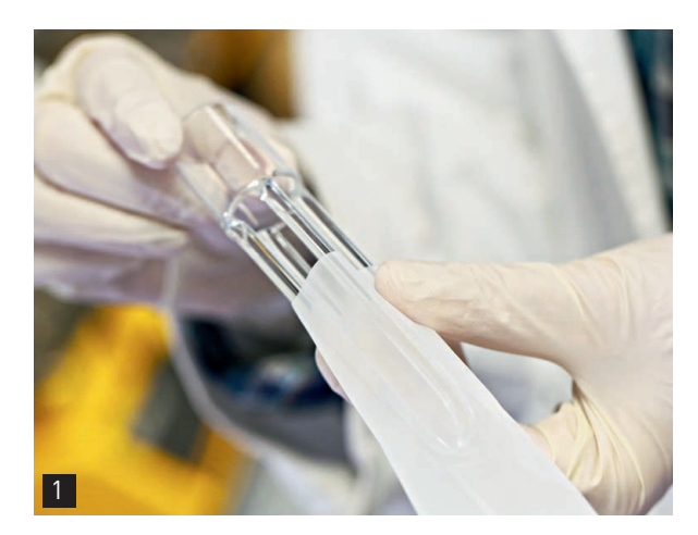
Easy handling: Insert FibreBag, weigh sample and you're ready. No need to seal the filter bag.