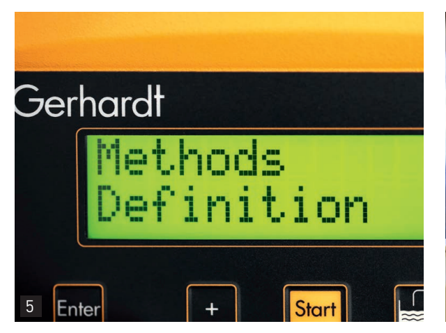
9 different methods can be freely configured and saved.