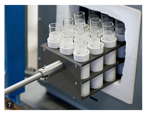
The incinerating module with a long handle makes handling of samples easier.