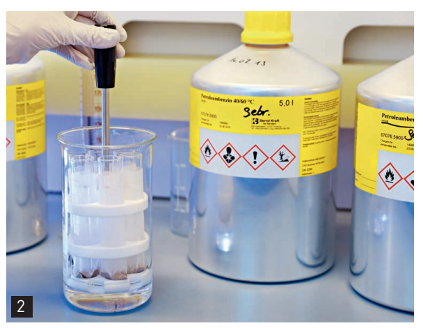
Convenient, time-saving degreasing with solvents in the degreasing module. 6 samples can be treated at the same time.